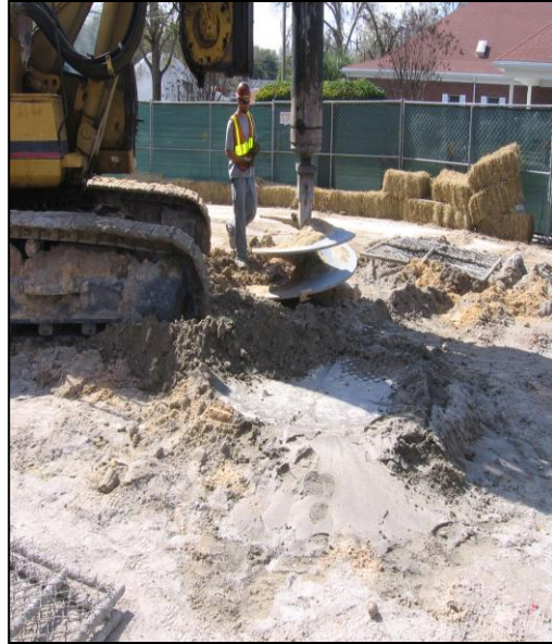
Photograph 6: Preparing to drill a LDA hole in front of the laundry mat.