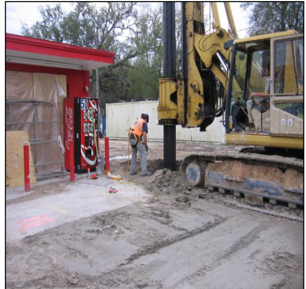
Photograph 4: Drilling a LDA hole east of the fuel lines and west of the water line.