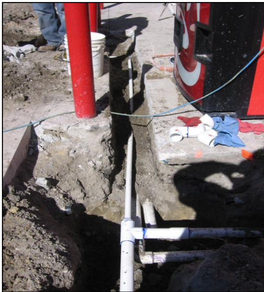
Photograph 3: Multiple water line to each of the site buildings and others on adjacent properties.