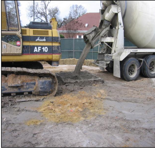
Photograph 5: LDA holes are backfilled through a metal grate for safety.