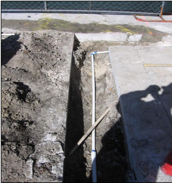
Photograph 1: Repair of a water line that was not located by public or private locate entities.