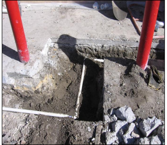
Photograph 2: Some water lines were not located. BBES hand dug for visual locate.